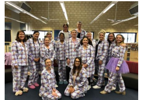
Our Kindy and PrePrimary teachers bought out all of the Sloth PJs!

Today we had a Year 5 and a Year 6 team commence the term 2 ' Have Sum Fun ' interschool math competition. These students were selected based on their ability to calculate and collaborate in their weekly maths extension class. We look forward to seeing how they progress over the next few weeks. Good luck teams! Year 3 and 5 students will be able to participate in the competition in term 3.