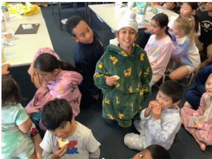
Room 14 and 32 students made butter in their PJs together.