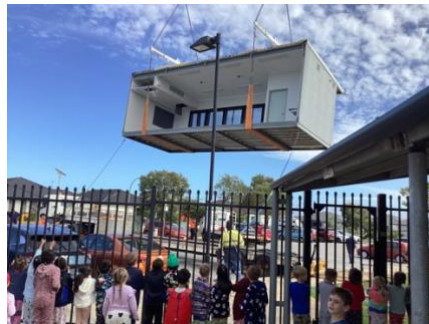
Room 5 and 13 watched our new art room arrive in their PJs.