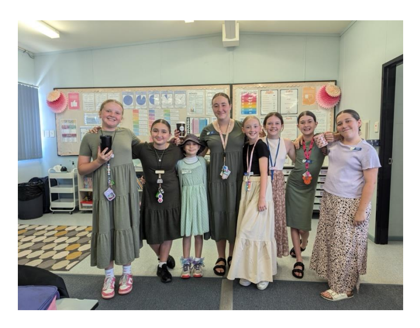
Learn · Grow · Thrive