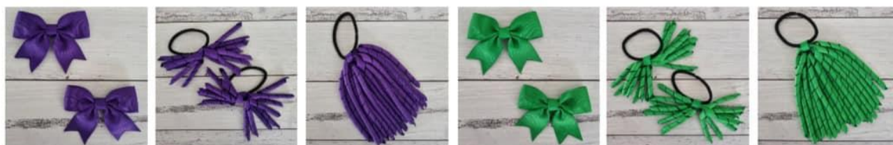
Tail Bow Set $4 Pigtail Ties $5 Hair Tie $5 Tail Bow Set $4 Pigtail Ties $5 Hair Tie $5