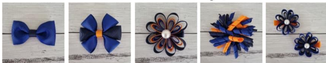
Basic Bow $2 Pinwheel Bow $3 Flower $3 Korker $4 Mini Flower Set $4