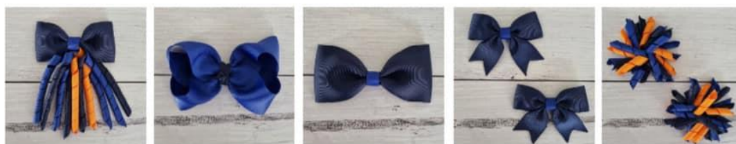
Korker Bow $4 Loopy Bow $4 Large Basic Bow $4 Tail Bow Set $4 Mini Korker Set $5