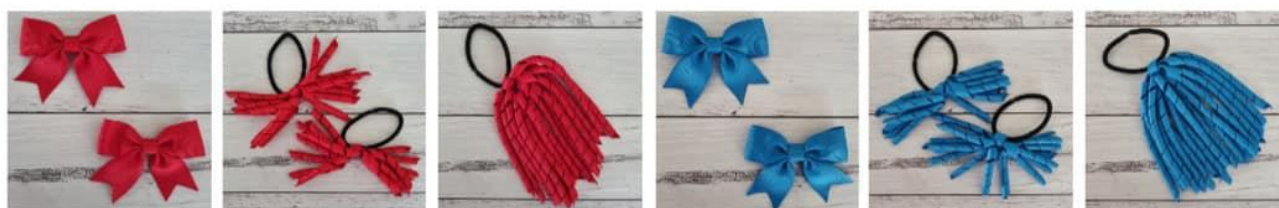
Tail Bow Set $4 Pigtail Ties $5 Hair Tie $5 Tail Bow Set $4 Pigtail Ties $5 Hair Tie $5