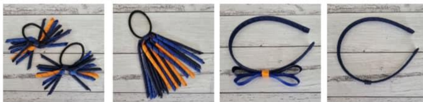
Pigtail Ties $5 Hair Tie $5 Bowtie Headband $5 Interchangeable Headband $3