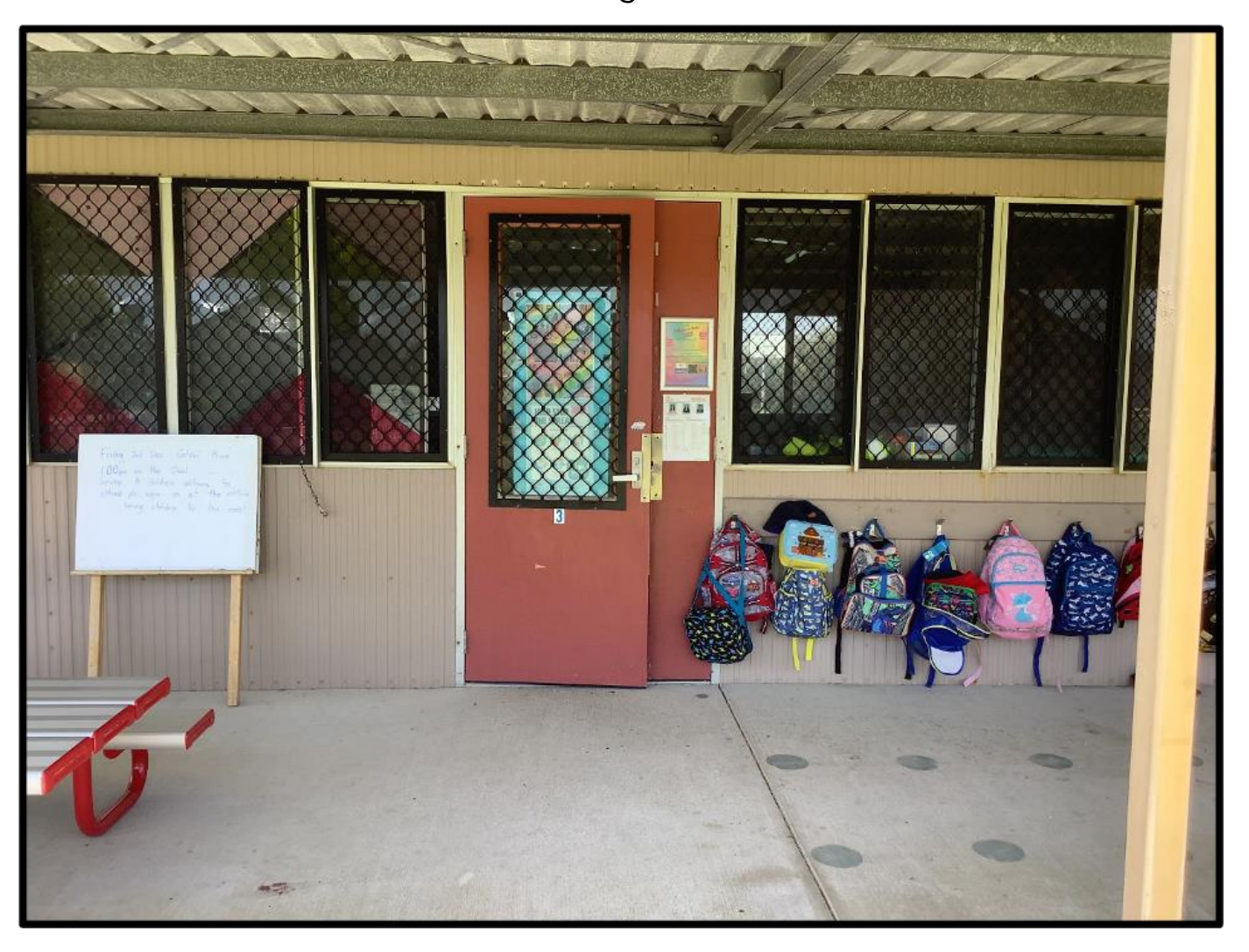
It is Room 3A