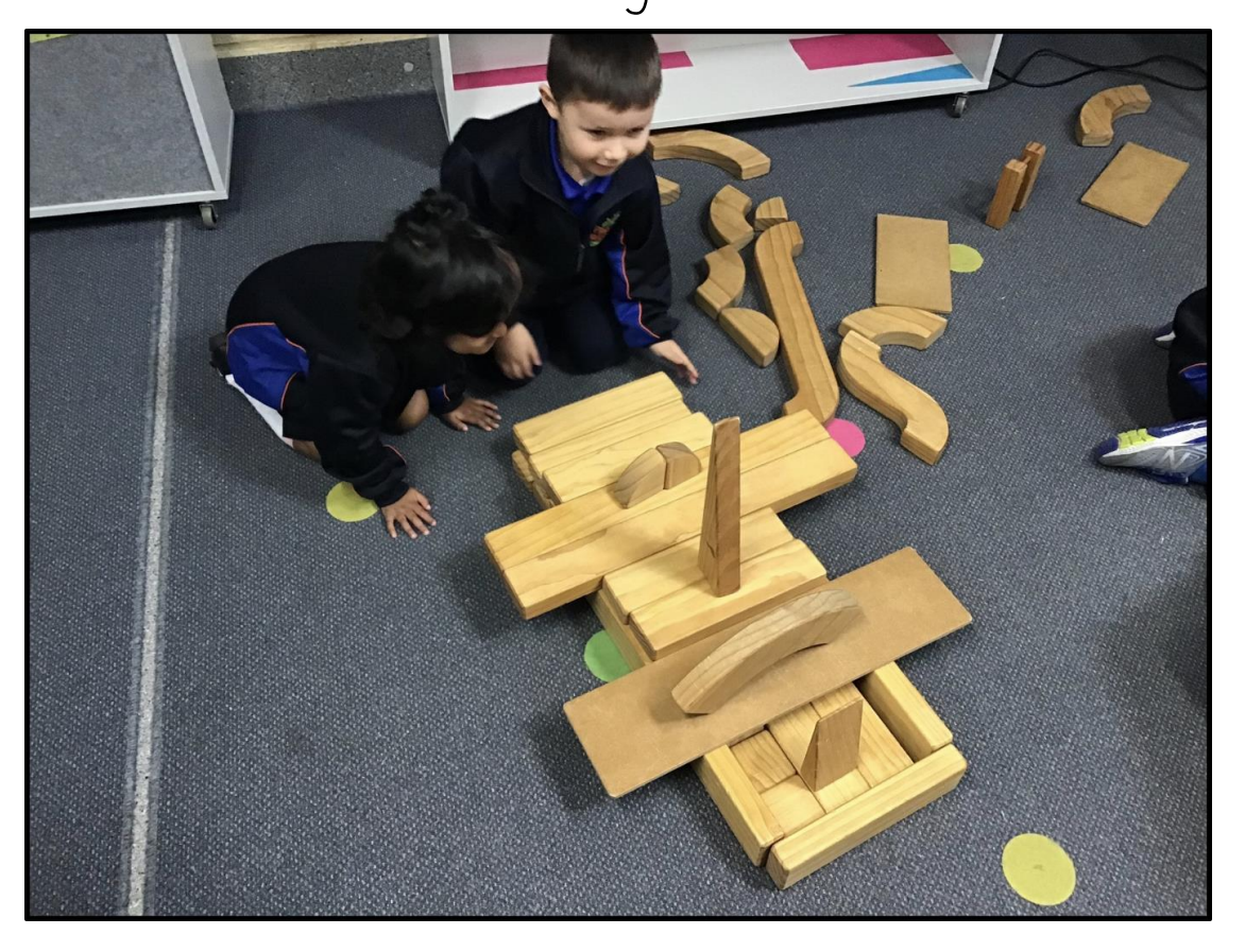
I will tell them about all the fun things I did at Kindy that day.

My family or after school care will pick me up at the end of the school day and take me home.