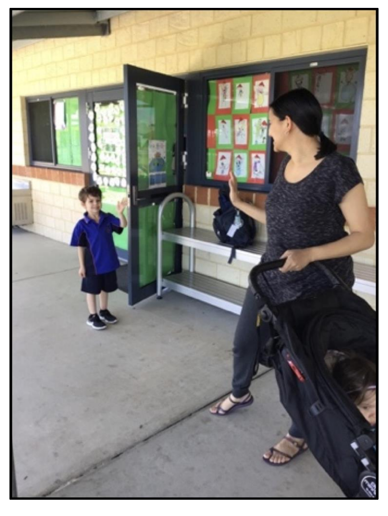
I will give my family a big hug, say "see you later" and wave goodbye! My family will say "bye" and leave.