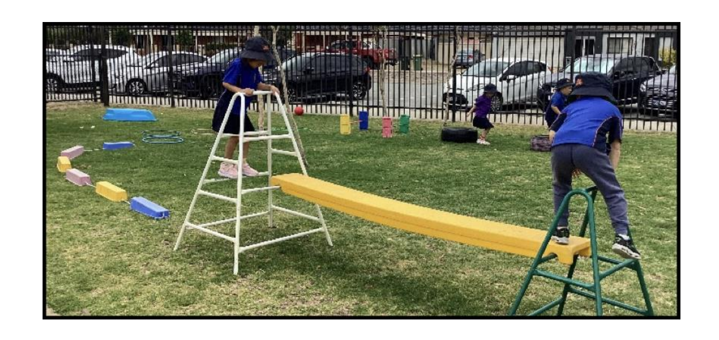
Do the obstacle course.